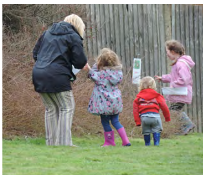
Easter Egg Hunt in progress at Hempstead playing Field Punch & Judy were there too!

The club meets every 2nd and 4th Thursday in each month and starts at about 8.30pm.