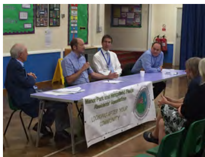
The Question Time panel